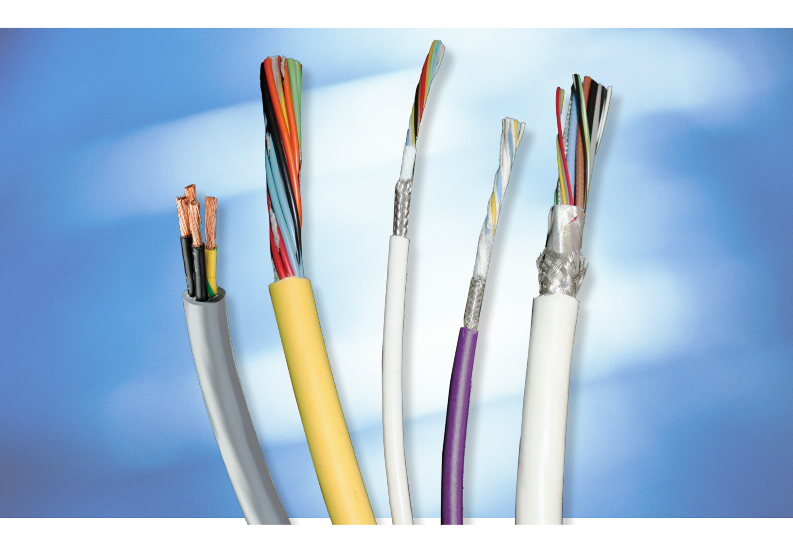
Engineering Your Success with Custom Cables