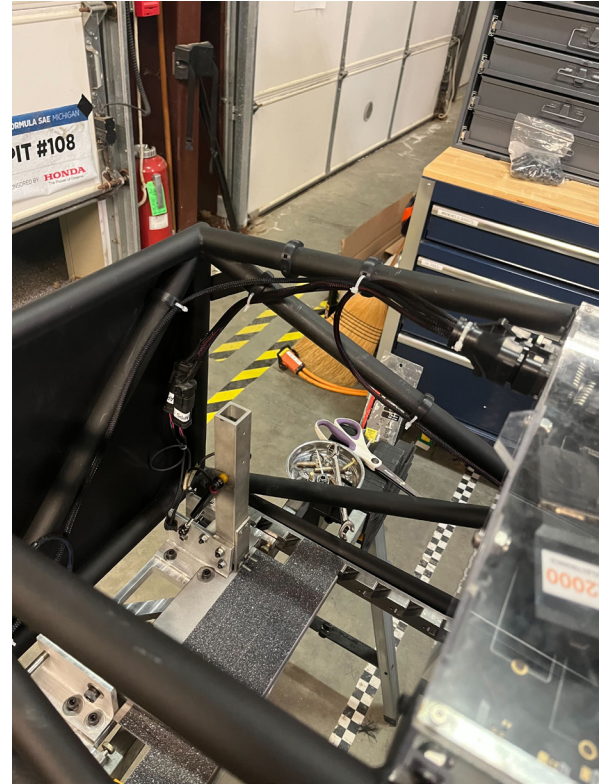
Pictured: Olin Engineering's integrated harness using Alpha Wire's products.