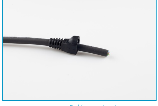
Cables you trust. Service you deserve.

2. First slide in the boot over the cable. Make sure its orientation is correct, and leave 3 inches of the cable at the end to be terminated.