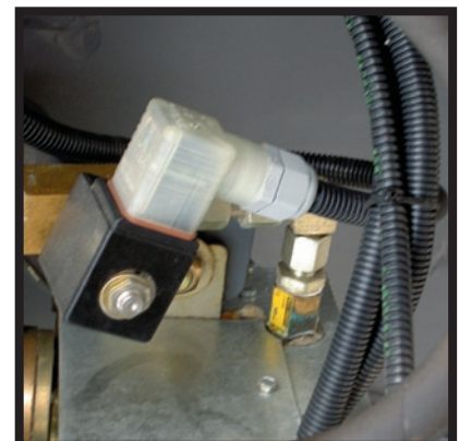
Hirschmann GDM Valve Connectors